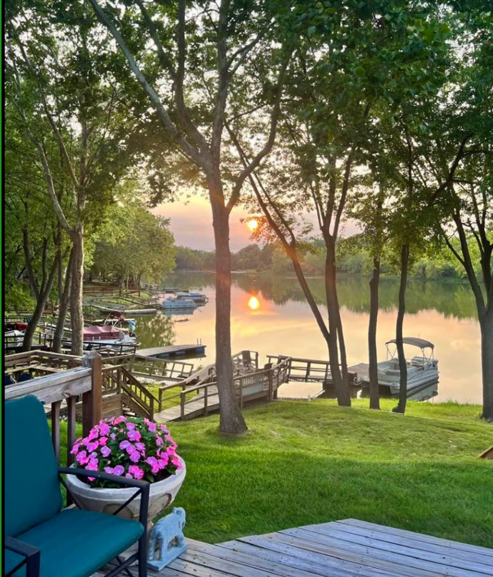
Sandy Point Beauty

Below is a screen shot of the Water level on the White River as taken at the 82nd Bridge location.