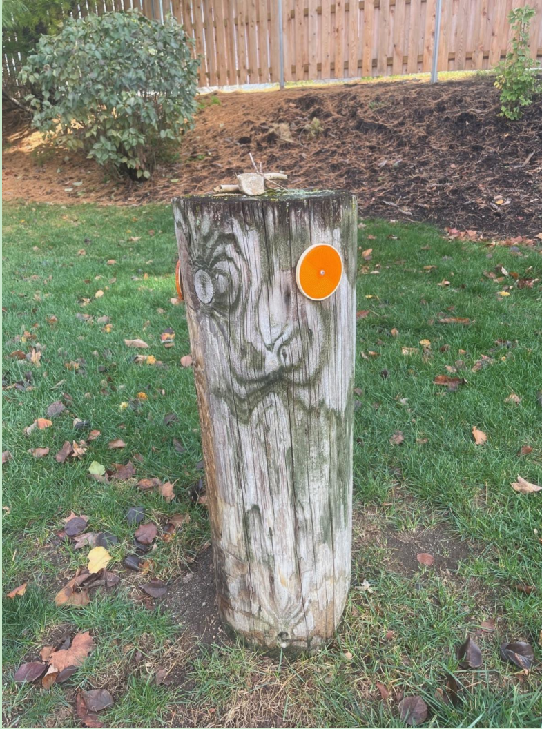
There's a Tiger in Sandy Point!

Below is a screen shot of the Water level on the White River as taken at the 82nd Bridge location.