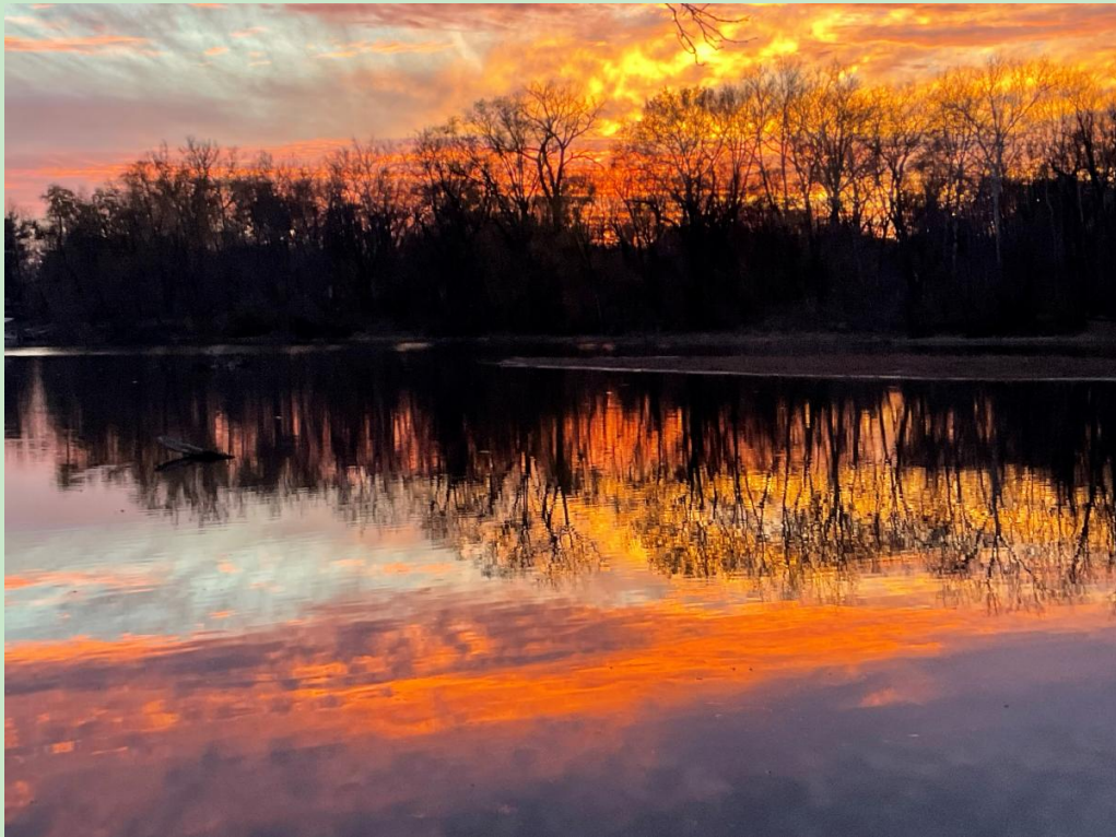
River Sunset

Please feel free to send me photos taken in Sandy Point or on the river. We may use them in the monthly newsletter. nshields@pscindy.com