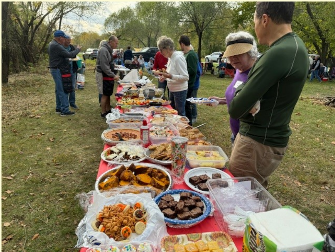
Our Pitch In Feast and Our Sandy Point Neighbors