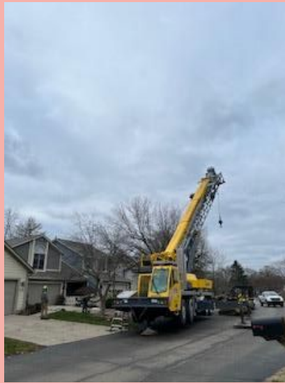
Crane on RBDN