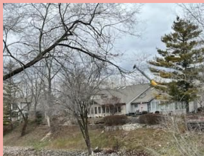
Crane from across the Inlet